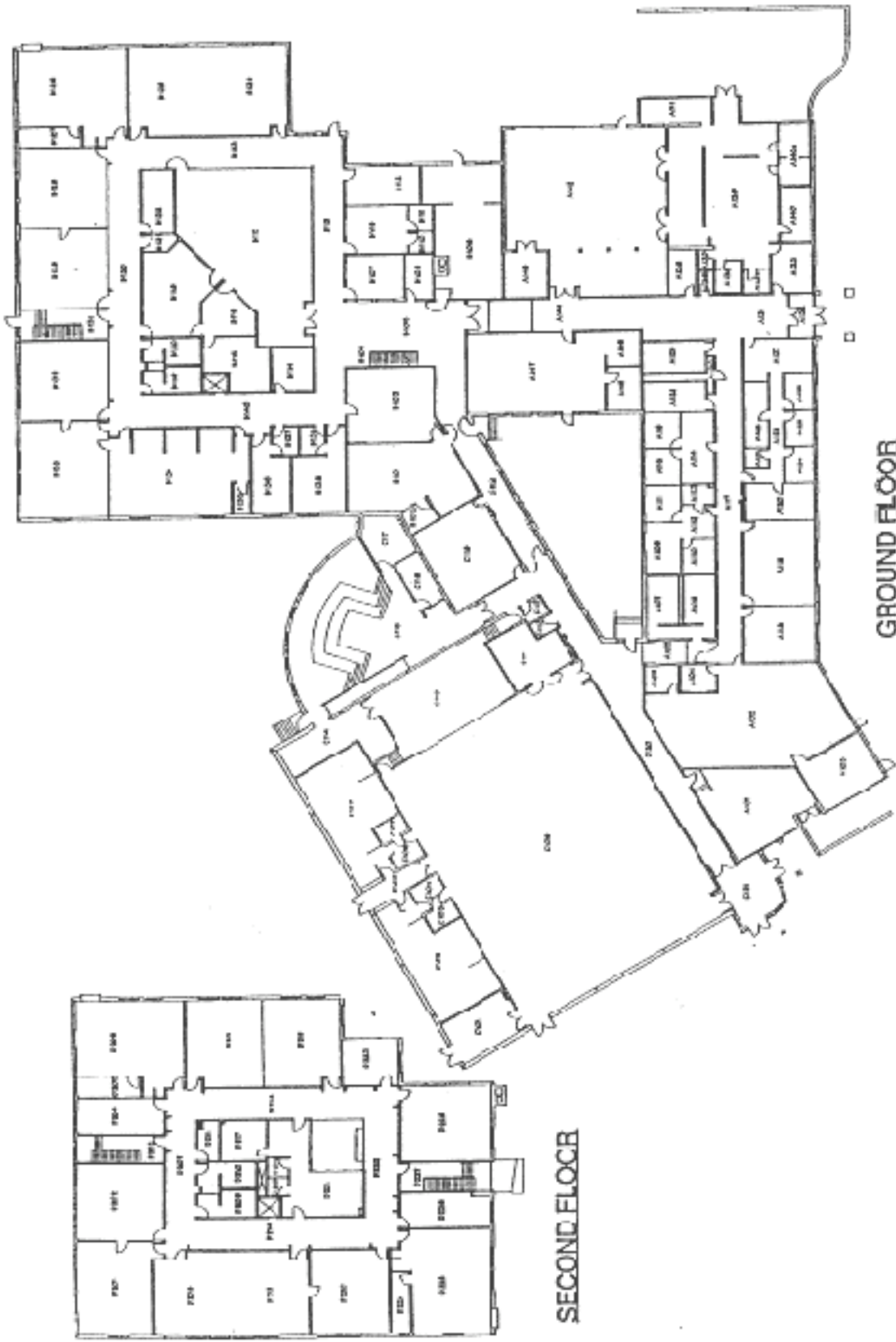
Shapleigh Middle School - Kittery, Maine